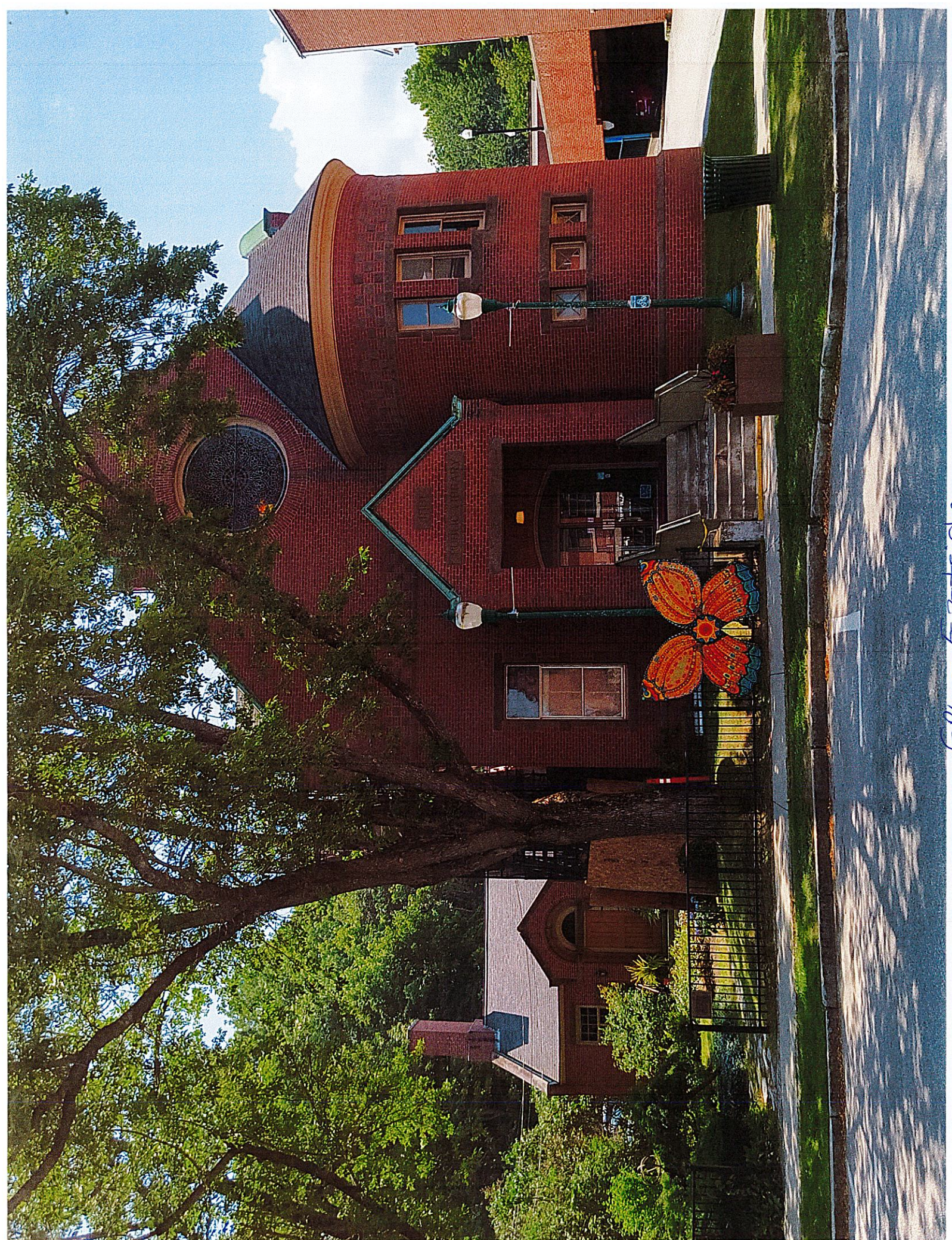
GPL - Eastside