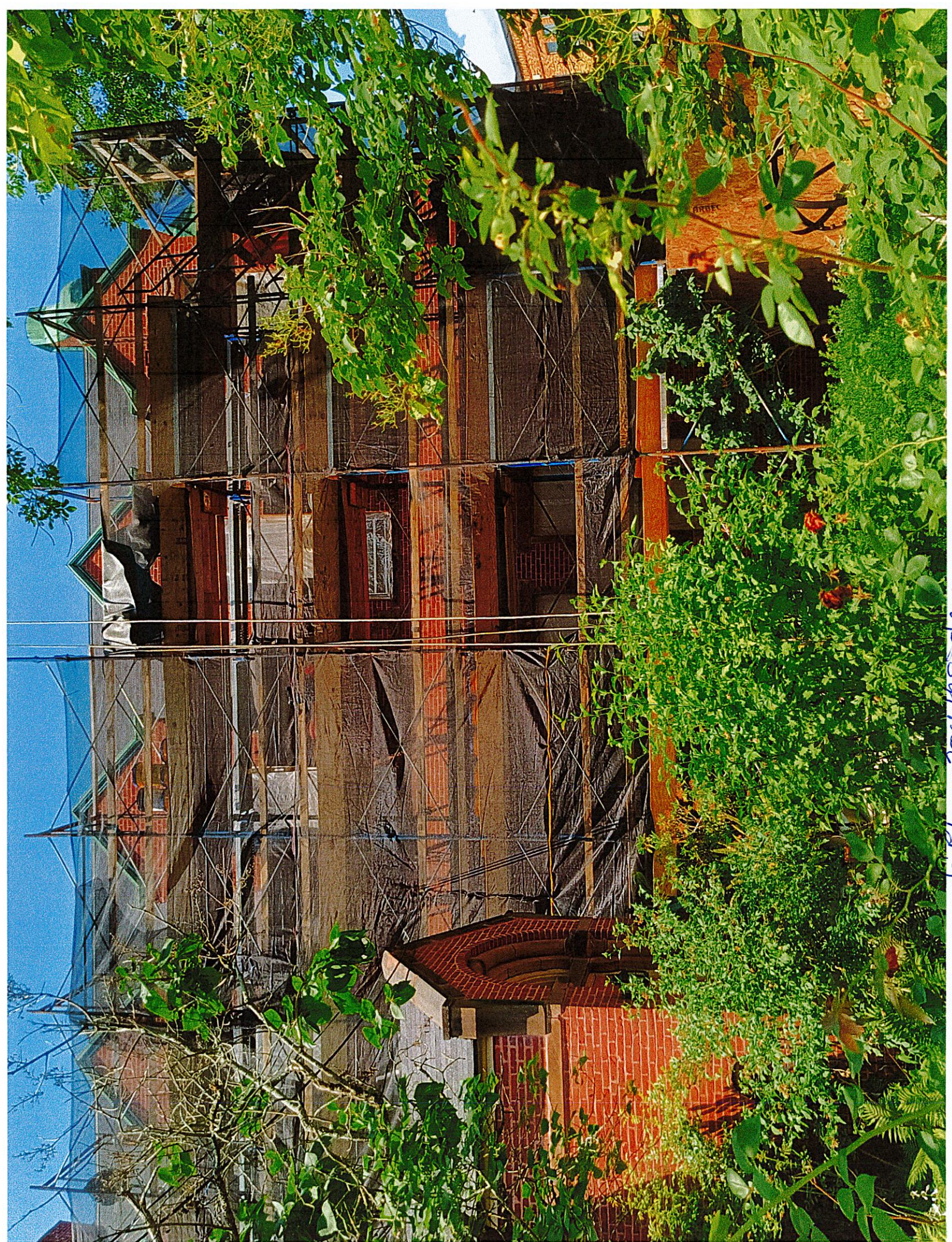
GPL - Youthside